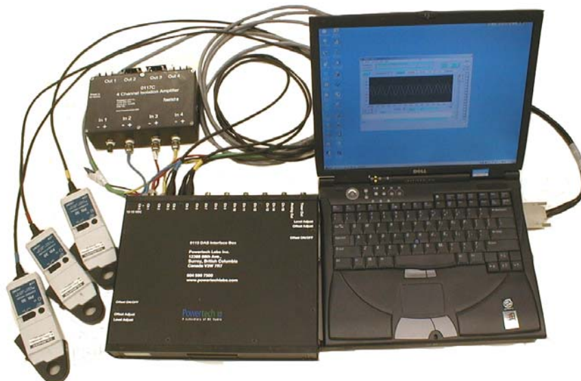
TABULA™ is available in a Basic Test Kit or a Deluxe Generator Test Kit including all required components and connectors in hard-shell carrying cases.