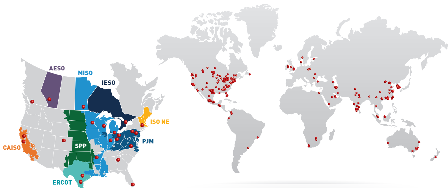
On-line DSA systems in U.S. / Canada

DSATools™ has a broad user base, which includes eight of the nine ISOs in North America and spans across six continents, encompassing some of the largest and most technologically advanced utilities and grid operators in the world. Powertech has issued over 220+ commercial licenses with more than 4,700 application seats.