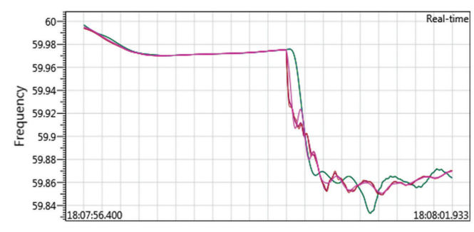
Visualization of simulated PMU data on PMU app